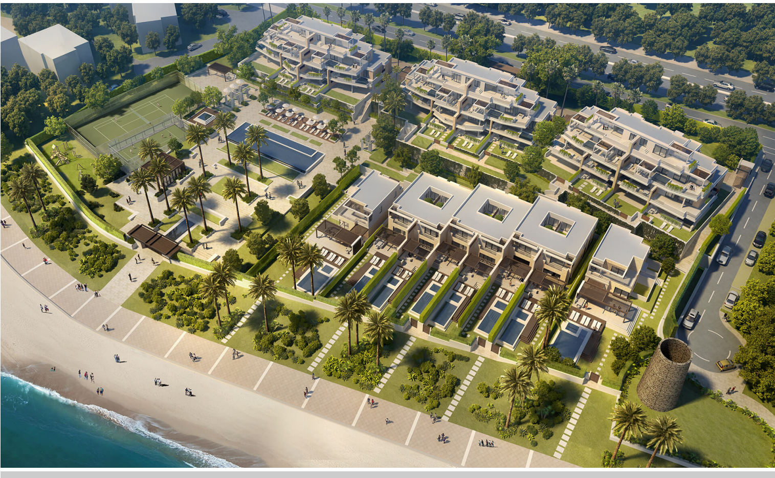
Apartment, Penthouse, Villa, Bungalow