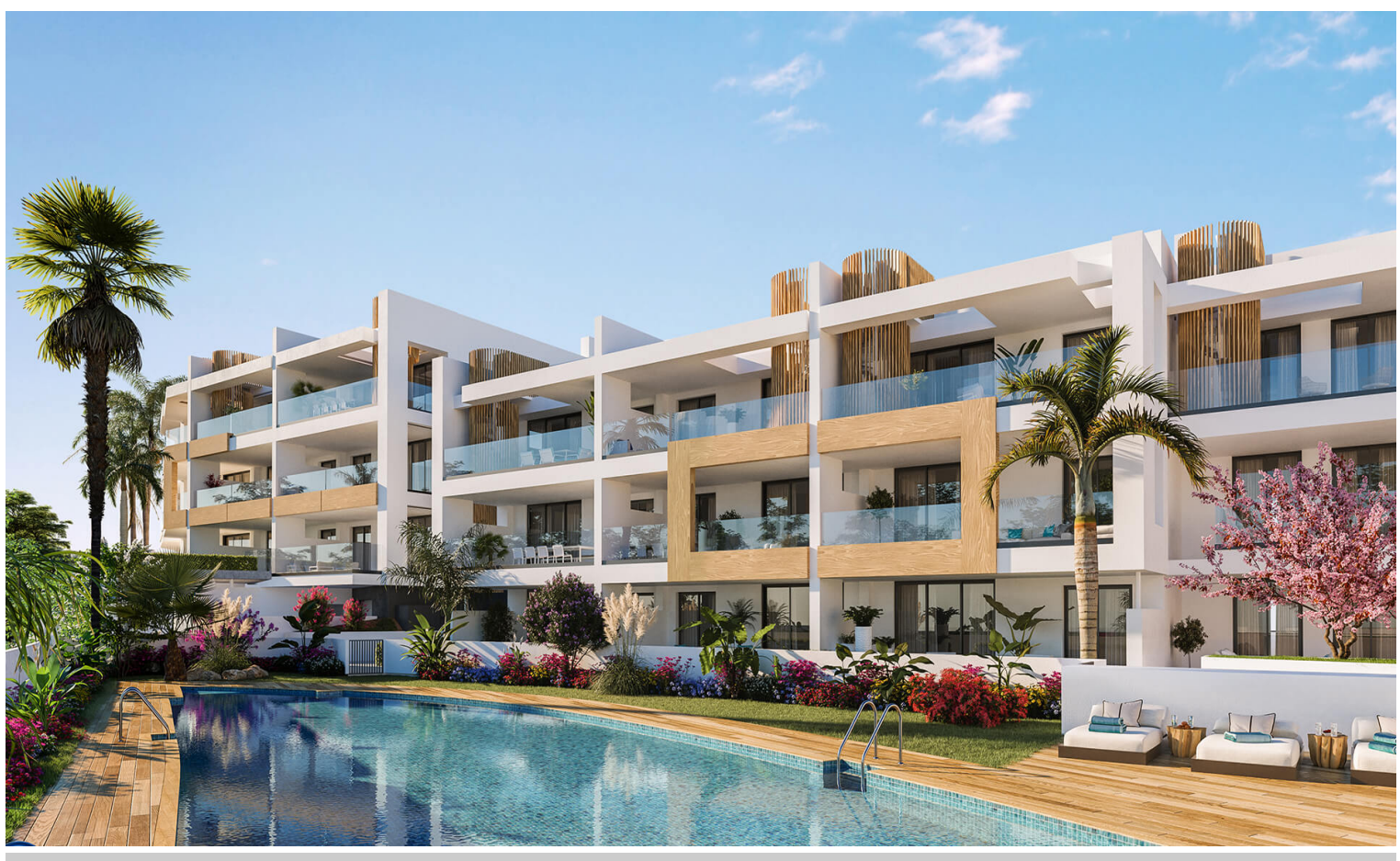
Apartment, Penthouse, Townhouse