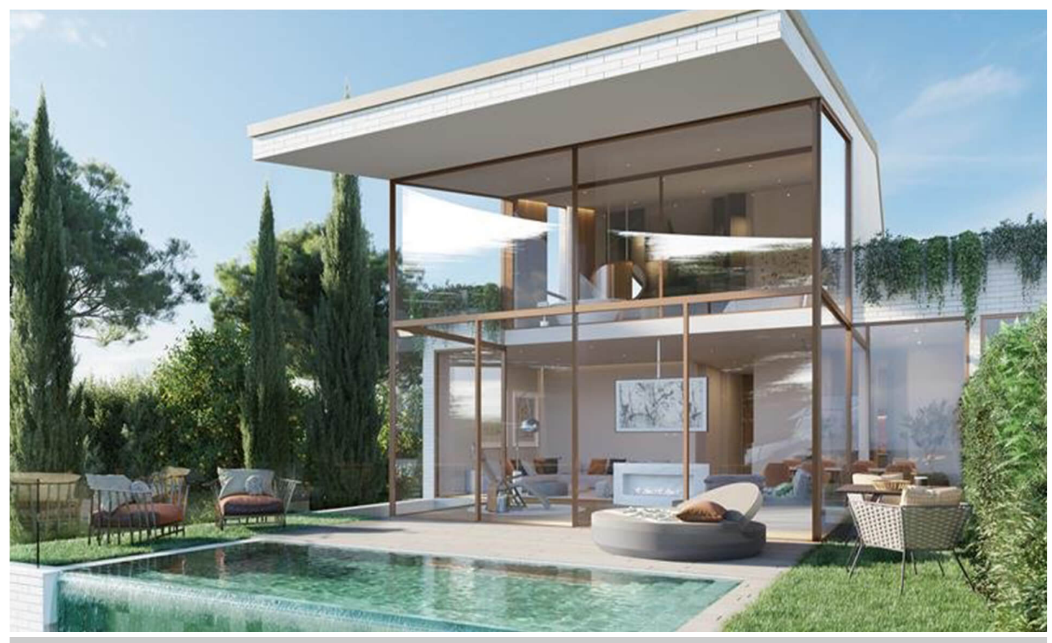
Apartment, Penthouse, Villa